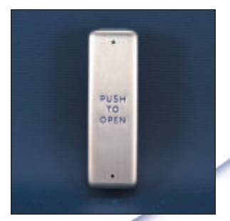
10PBJ - Text only